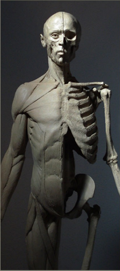
Écorché Sculpture, oil clay, 75cm