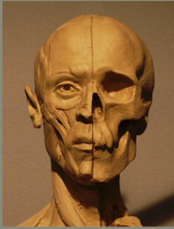
Écorché Sculpture - detail