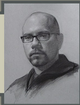
Self Portrait, chalk and charcoal on toned paper, 40 x 50cm