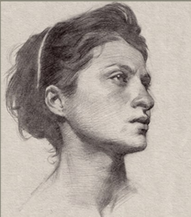
Sara, graphite on toned paper, 12 x 15cm

Arte Verissima is a fine art conservatory dedicated to the realist tradition.